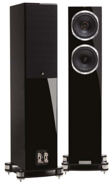
SP models retain the standard F501 & F502 models convenient magnetic rear grille storage feature for use during playback.

The result is a true audiophile loudspeaker design, with tighter bass, more fluid high frequency reproduction and the pinpoint imaging of a true point source loudspeaker design.